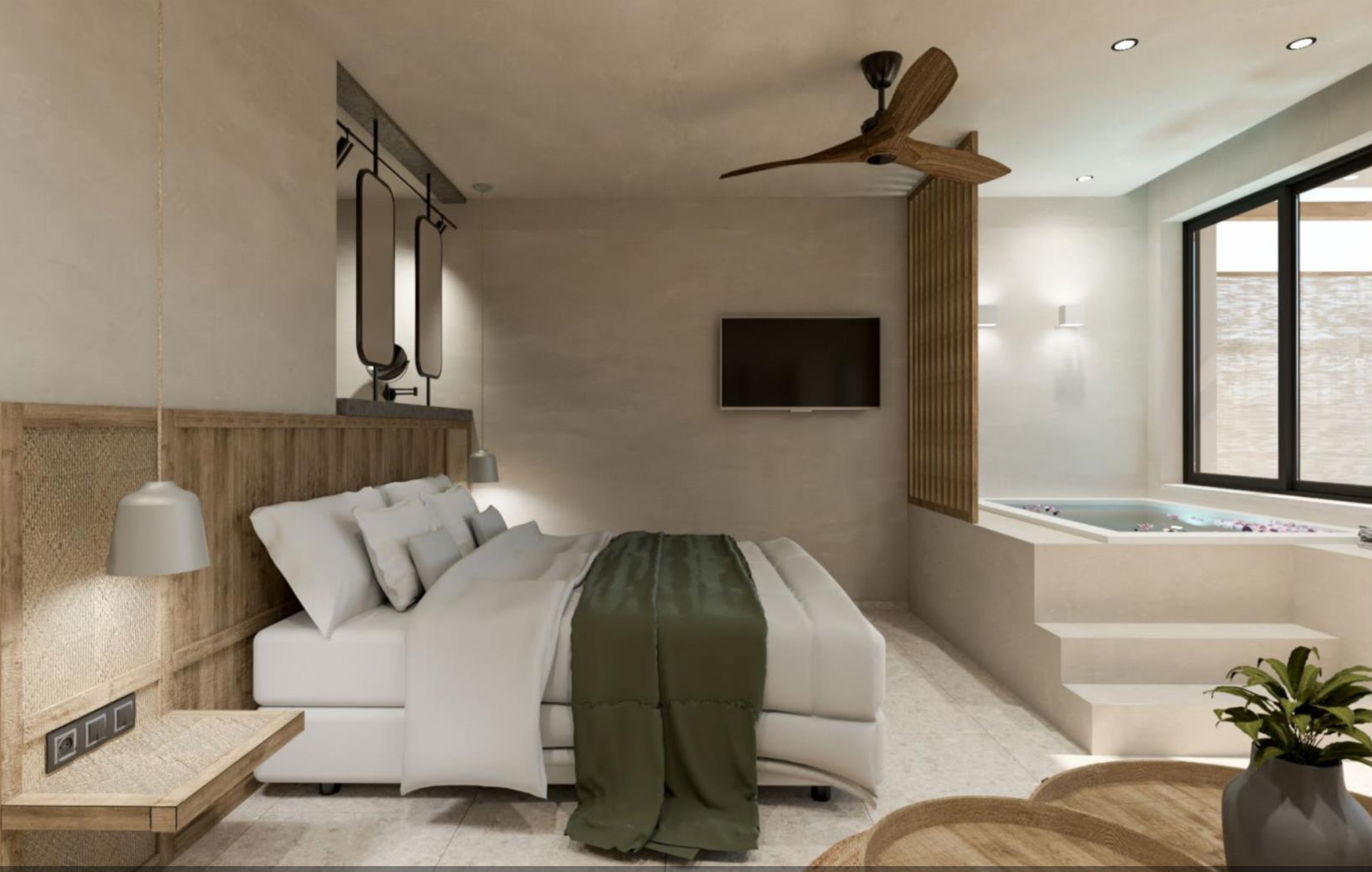
3 bedroom suite with Jacuzzi