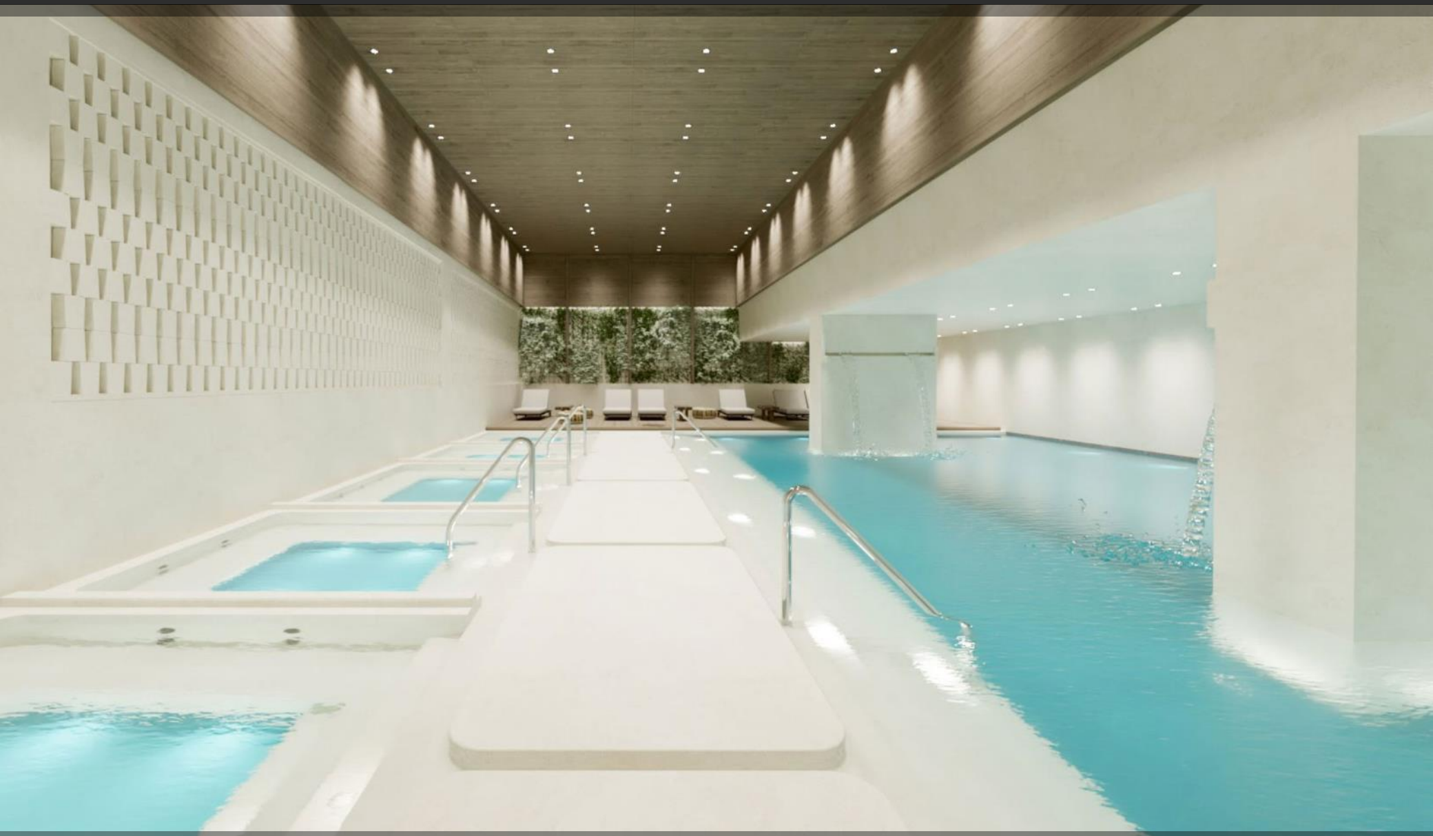
SPA & Wellness Center