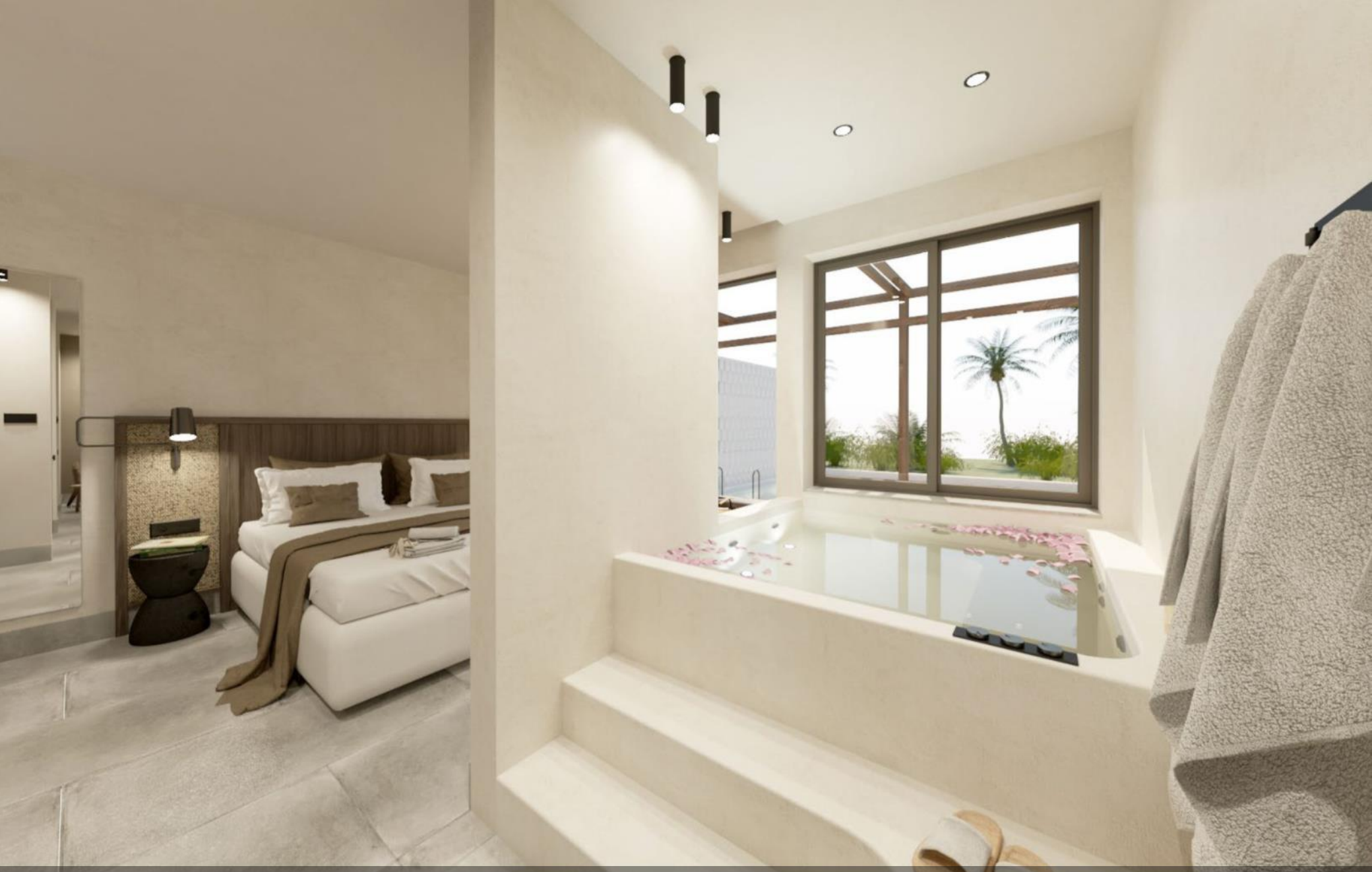
Suite with Jacuzzi